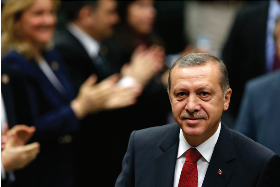
Turkey's Prime Minister Recep Tayyip Erdoğan greets members of the Parliament from his ruling AK Party during a meeting at the Turkish Parliament in Ankara.