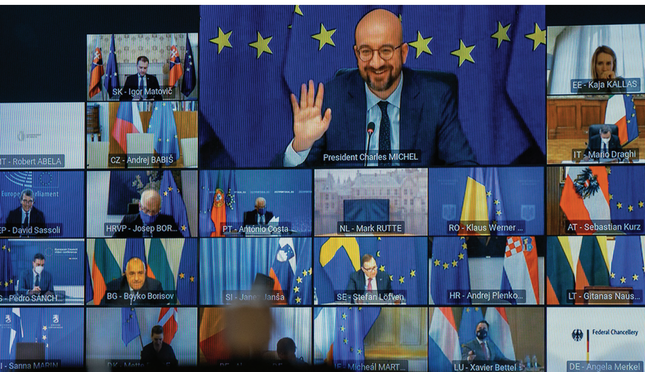
European Council President Charles Michel leads EU Leaders' Summit held via a video conference in Brussels, Belgium, on March 25, 2021.

them to achieve balance in Europe. COVID-19 thus illustrates the extent to which the national interest of EU states triumphs over the liberal goals and values on which the union was established and poses multiple questions about the union's future.