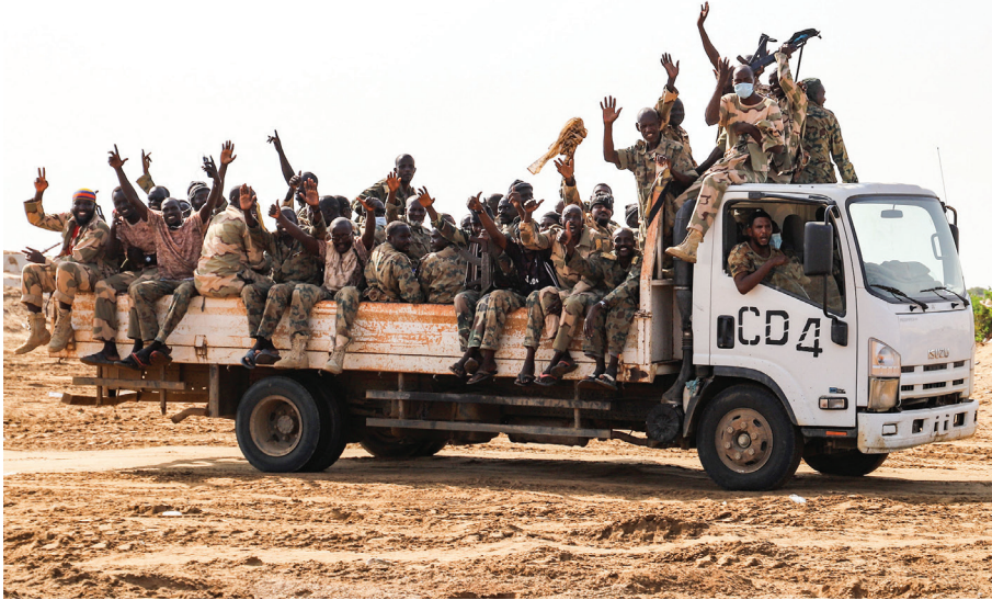
Fighters from a Saudi-backed Sudanese-Yemeni military force battling Houthi rebels are pictured near the border with Saudi Arabia in Yemen's Northern coastal town of Midi, on May 23, 2021.