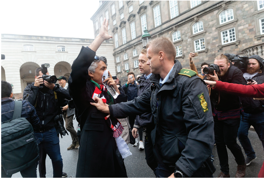
Danish police interrupt the French-Algerian businessman, Rachid Nekkaz as he speaks in front of the Danish Parliament and offers to pay the fines for Muslim women who have been in violation of the country's new burqa ban. Copenhagen, Denmark on September 11, 2018.