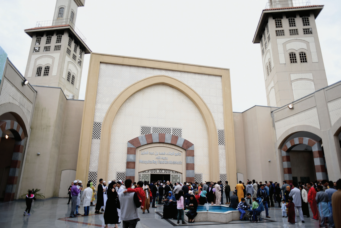
Muslims gathered at the Islamic Cultural Center in Buenos Aires, Argentina to perform Eid prayers, on June 25, 2016.