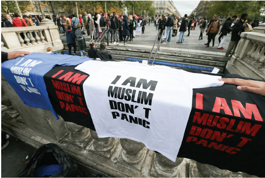
Shirts reading "I Am Muslim, Don't Panic" are exhibited on Place de la Republique in Paris during a demonstration after a far-right politician asked a woman accompanying her son and other children on a school trip to remove her headscarf. In Paris, France on October 19, 2019.