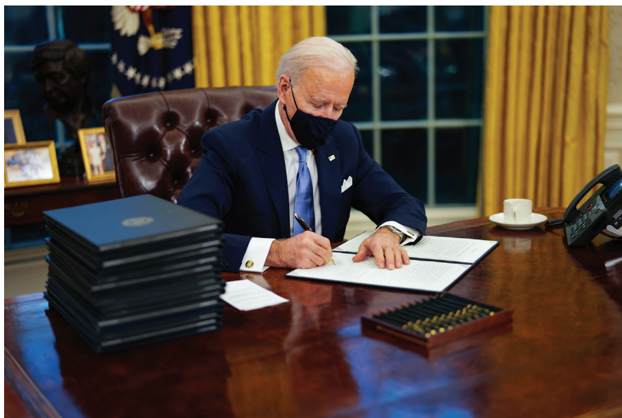
U.S. President Joe Biden signing his first decrees after his inauguration ceremony, on January 20, 2021.