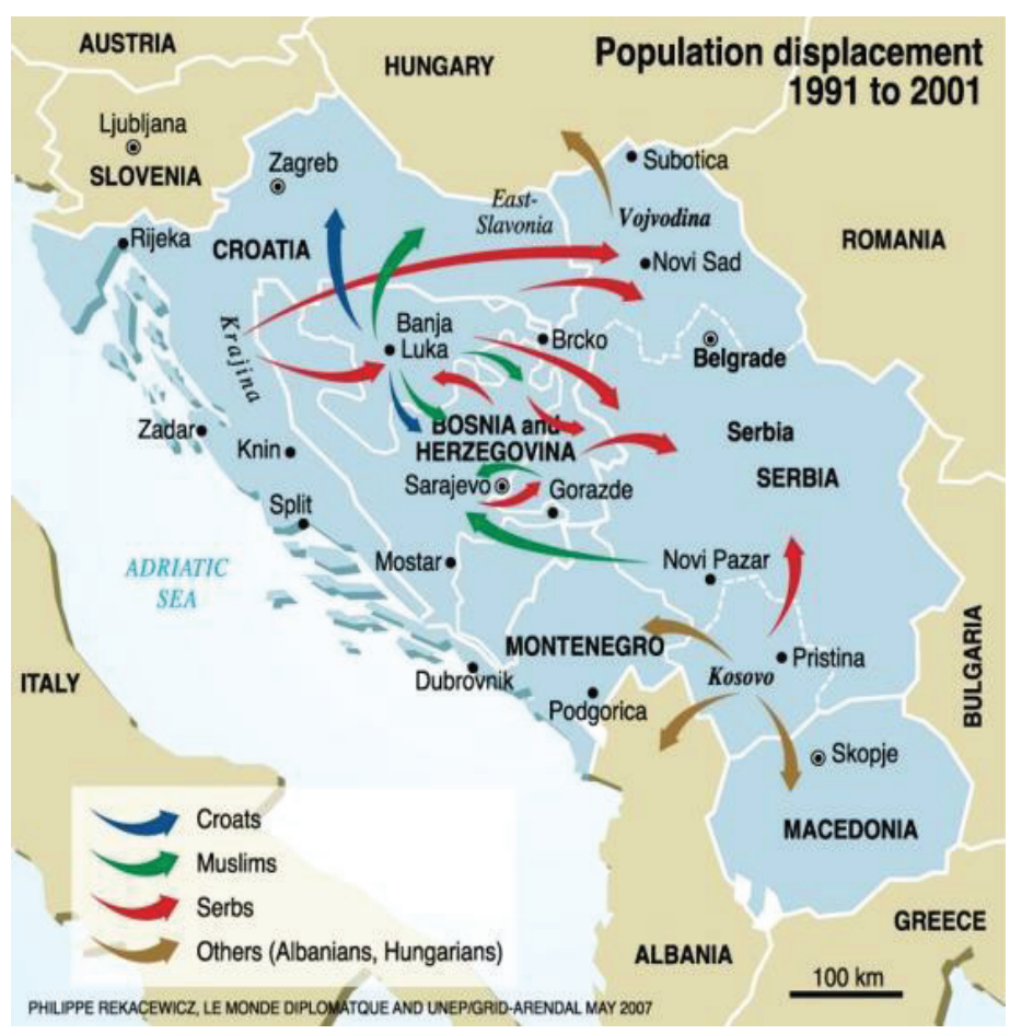
Map 3: Population Displacements