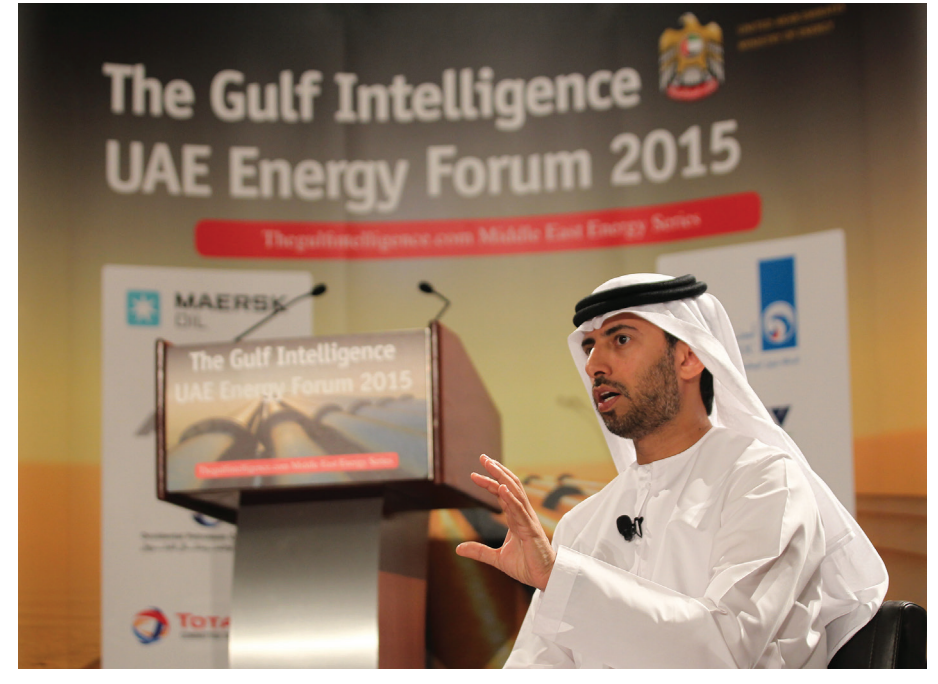
UAE Energy Minister Suhail al-Mazrouei speaks during the Gulf Intelligence UAE Energy Forum in Abu Dhabi on January 13, 2015.

security goes down) have reached their lowest level in four and a half years.<sup>7</sup> That is to say that most of the money managers bet their money on decreasing oil prices. In the literature one can find both views supporting each side of the discussion. Is it the hedge funds that cause speculation, or pricing of "Fundamentals" by these funds? Nevertheless, a pragmatic view-point would be to watch net long and short positions in the paper markets to improve the forecasting of the trends in oil prices.